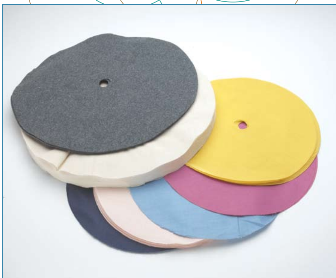
Simple sections buffs