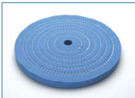
with treated cotton Royal Blu