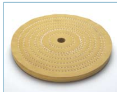
with treated cotton Golden GG