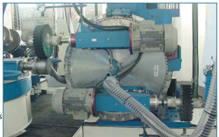
Polishing of cookware

- applications: for roughing operations of steel, chrome, iron (pots and pans, tableware, tubes and pipes);