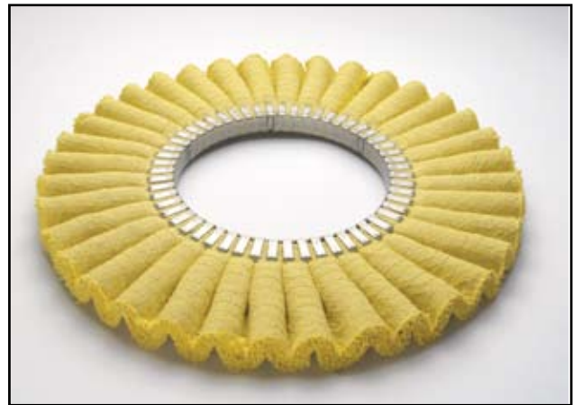
art. 1111 with impregnation type YELLOW