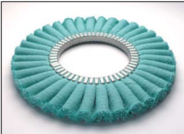
art. 1111 with impregnation type GREEN