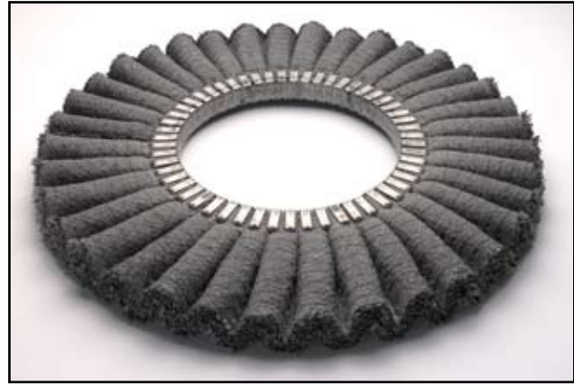
art. 1111 with impregnation type GREY