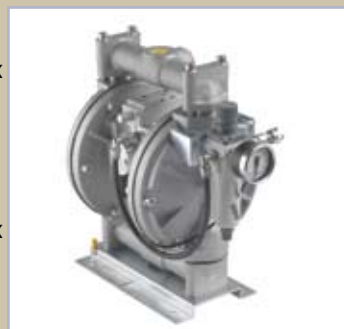
Pump mod. PM/500 - SP