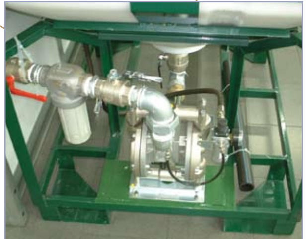
Pump and Filter assembly on the tank "Siletto"